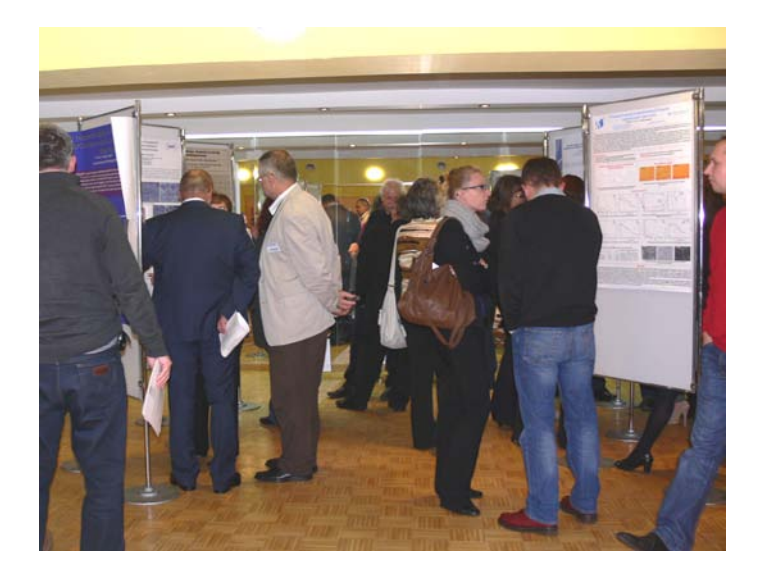
APCS-2012: Poster Session

54 original contributions were presented during the Symposium (34 oral presentations + 20 posters). Among the oral contributions ten were presented in English, both by Polish and foreign participants.